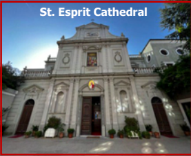
St. Esprit Cathedral

October 07-18 • October 14-25 • November 04-15 • November 11-22