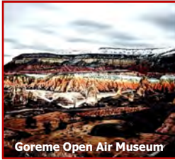
Goreme Open Air Museum